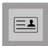
My ID Card